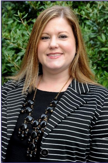
Member Services Director