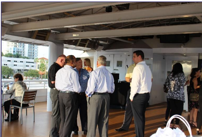
40 th Annual Conference