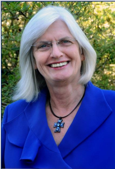
President & CEO