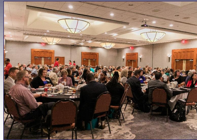
2017 Annual Conference

Florida ARF creates networking opportunities for member agencies via issues forum meetings: Community Supports, Employment, Legal Advocacy, ICF/IID, Government Relations, and RESPECT Oversight. Members communicate their concerns via meetings teleconferences, and agency to agency interaction.