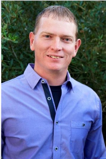
Chief Financial Officer