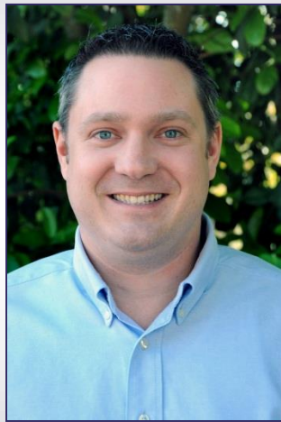
Information Technology Administrator