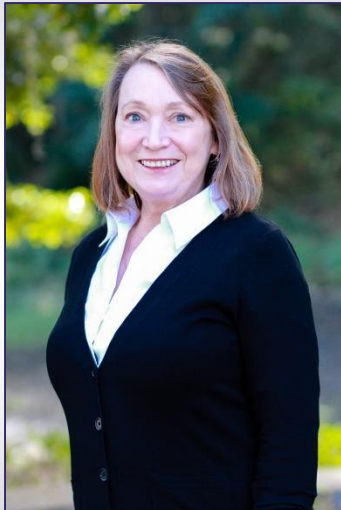
Member Services Specialist