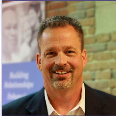
Vice President of Operations The MENTOR Network

“The networking Florida ARF has fostered with my colleagues (such as sharing ideas, best practices, client success stories, etc.) during the last 17 years has proven to be one of the most valuable usages of my time. The expertise and dedication within the Association’s membership is evident once you make a commitment to listen and become part of the process to enhance the lives of the people we are driven to serve. During the past decade, Florida ARF, in my opinion, has done more for the advancement of persons with intellectual disabilities than any other private group in the State.”